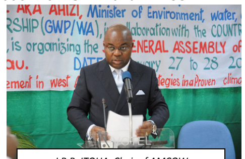
J.R.B. ITOUA, Chair of AMCOW

Seven personalities facilitated this panel, which allowed identifying various fields of actions to be brought into focus to face the growing poverty of the African people through IWRM (cf Final communiqué of GWP/AMCOW session in appendix 1).