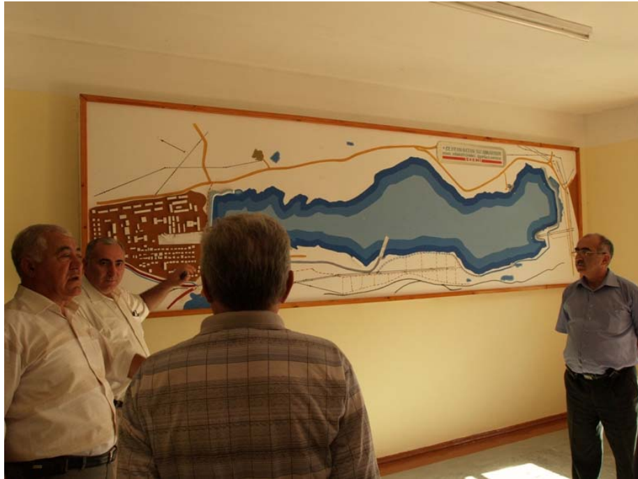
Picture 5.1. Azeri colleagues explain to GWP CACENA delegation their plans of reconstruction and development of the water supply system in the areas surrounding Baki at the expense of the state budget of Azerbaijan (2008)

Distribution of the WSS regulation functions among various ministries and state authorities that have different priorities does not facilitate achievement of the required level of functioning, operation and the overall and equal development of WSS systems. Institutional structures for regulation, management and development in many countries of the region still need reforms depending on the national policies and strategies in each of the regional states.