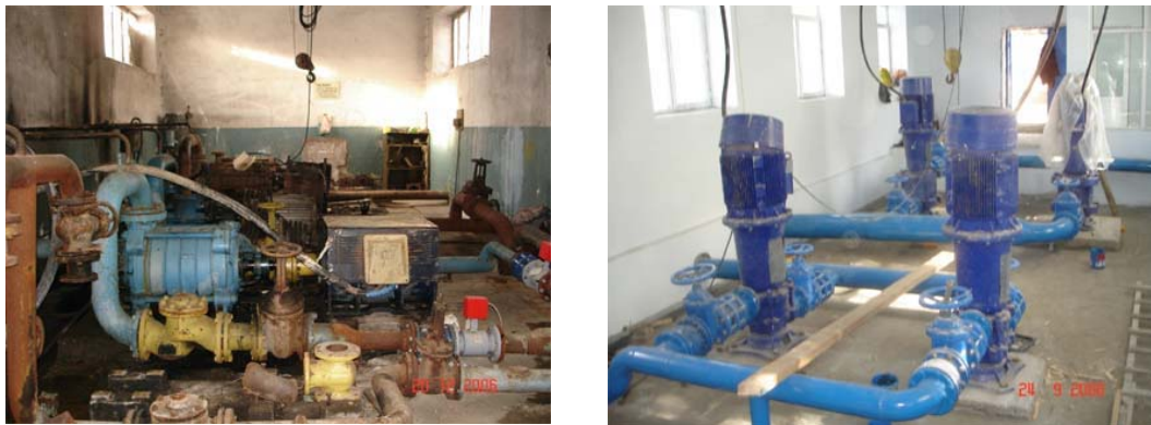
Picture 6.1. Aparan Pump Station in Armenia – prior and after reconstruction

The process of WSS transfer to private owners began in Georgia in 2008. That year the State has sold to the firm “Multiplex Energy Limited” the following entities: “Rustavivodokanal,” “Mtskhetavodokanal,” “Tbilisi Water” and “Gruzvodokanal,” the latter owns the regional treatment facilities in the cities of Tbilisi and Rustavi. According to the contract the Firm should modernize the existing water supply and sanitation systems and to improve the water supply in the cities of Rustavi, Tbilisi and Mtskheta.