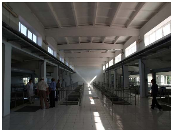
Picture 3.1. Newly constructed chlorination plant for drinking water in Azerbaijan

In Soviet period about 20 sewage treatment plants used to operate in Armenia, they used to cover the capital city of Yerevan, 25 other cities and towns and 55 rural settlements. Out of the number of existing STPs at present only the Yerevan Aeration Plant is operating, effectuating only mechanical treatment of some portion of the sewage. Starting from 2004 decisive steps have been taken in order to rehabilitate the sanitation and sewage treatment plants of Armenia.