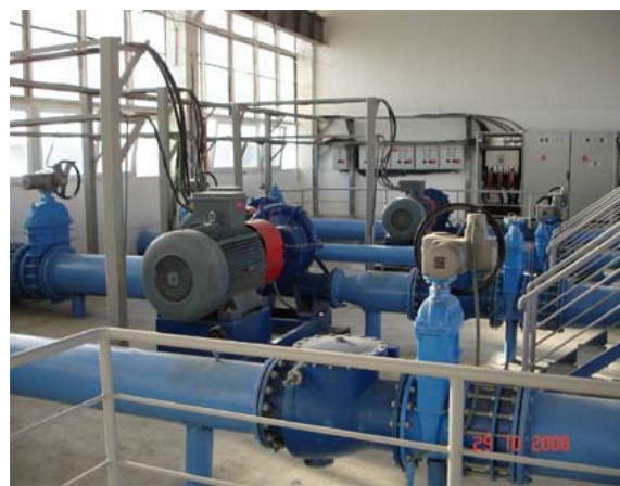
Picture 3.2. The Ararat Pump Station: prior and after reconstruction

In Georgia the coverage of centralized sewage system on average ranges from 28,7% in small settlements to 93,2% in major cities. However, in some urban settlements there is no centralized sewage system. Sewage systems are available in 45 cities of Georgia, but the state of those systems is very poor. STPs have been built in 33 cities. Those plants were put into operation during the period of 1972-1986. At present, none of the biological treatment steps of the plants is functioning. Mechanical treatment of sewage is being operated to some extent only in the STPs of Tbilisi and Rustavi, however the major part of the facilities is virtually out of operation. In settlements, where there are no treatment plants, sewage discharge directly into the natural surface water bodies. In recent years one sewage treatment plant with complete biological treatment has been built in the city of Sakhchere.