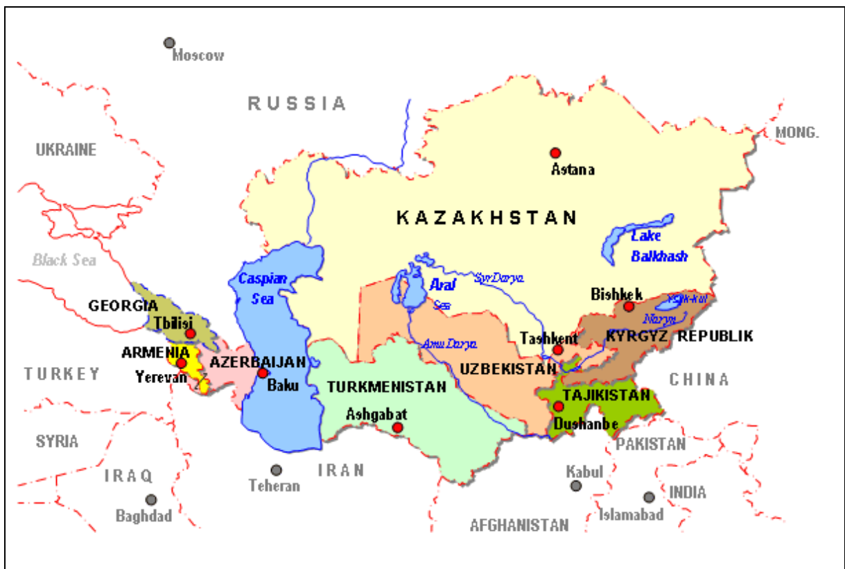
Picture 1.1. Geographical location

The Central Asian states (Kazakhstan, Kyrgyzstan, Tajikistan, Turkmenistan and Uzbekistan) are located in the center of the Eurasian Continent. Neighbors of those countries are Russia, China, Iran and Afghanistan. Western borders of Kazakhstan and Turkmenistan are being washed by the Caspian Sea. South-East borders of those countries stretch over the Tien Shan and Pamir Mountains. Republics of the Southern Caucasus (Azerbaijan, Armenia, and Georgia) are typical mountainous countries with a specific complex mountain terrain, which are situated to the south of the Caucasus Range between the Black Sea and the Caspian Sea. Southern borders of those states (Armenia, Azerbaijan) are being defined by Araks River. Countries of the Southern Caucasus have borders with Russia, Turkey and Iran (Figure 1.1).