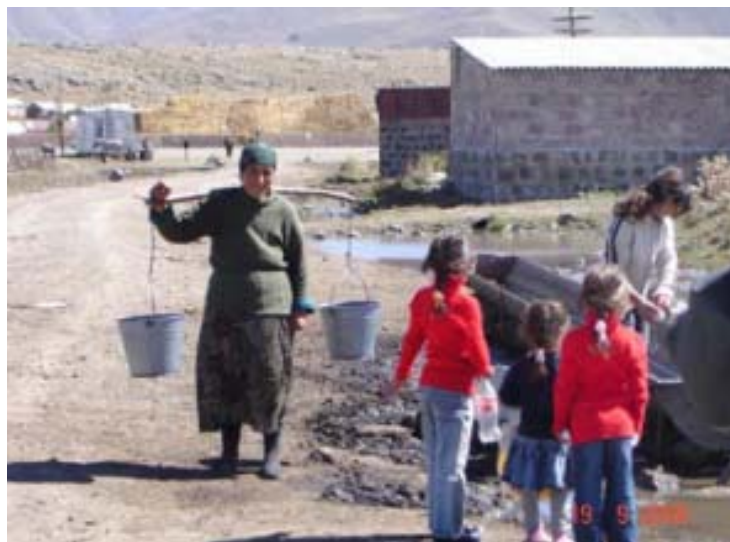
Picture 6.2. Rural water supply in Aparan District of Armenia