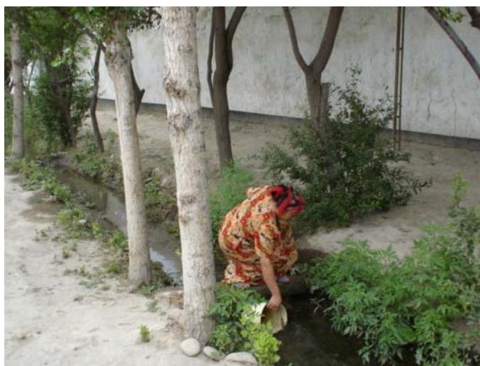
Picture 3.1. Over 40% of rural population in Fergana Valley use untreated water for household needs out of the wells and aryks (open ditches).

In Uzbekistan there are 265 cities, towns and settlements, 11.844 villages, including 903 in the hardly accessible small villages. In certain provinces of the country (Bukhara, Khorezm, Karakalpakstan) coverage of population with water supply systems is only 20-25 %. Water ducts and water supplying pipelines in the cities and settlements of the country are made out of the steel pipes. During the last 20-25 years of their operation, their wear-and-tear rate has reached 50%. Water pipelines are not being to their full capacity, thus water losses reach the rate of 40%. The oldest and the most developed system in Uzbekistan is the potable water supply system of the city of Tashkent. Water supply of Tashkent is being effectuated out of two sources: surface and underground located in the basin of Chirchik River.