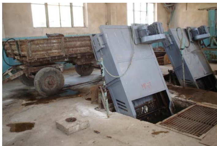
Picture 3.3. Debris filter of the treatment facilities in Fergana, Uzbekistan