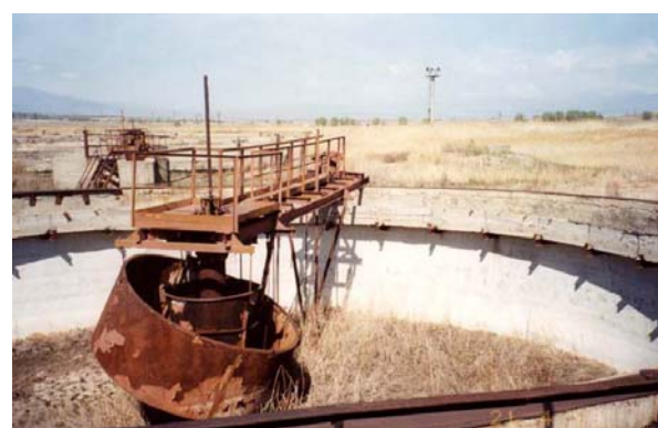
Picture. 3.4. Actual state of some of the treatment plants in the Southern Caucasian countries