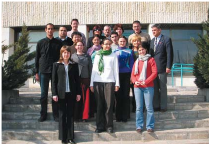
ENGREF team with GWP Consulting Partners in Veliko Tarnovo

ENGREF-Montpellier organized the training in association with the Bulgarian Academy of Science, the Bulgaria Water Partnership, the Regional Inspectorate of the Environment and Water in Veliko Tarnovo and UBI-FRANCE-Bulgaria