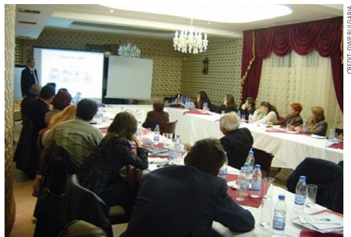
IWRM National Dialogue in Bulgaria