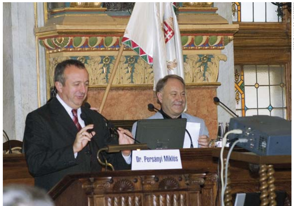
Miklós Persányi, the Minister of Environment, opened IWRM National Dialogue