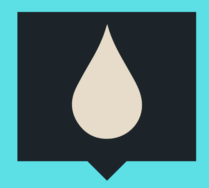
Support Caribbean Countries in Better Water Management