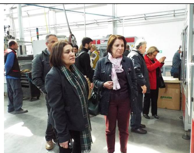
At the Elbat enterprise