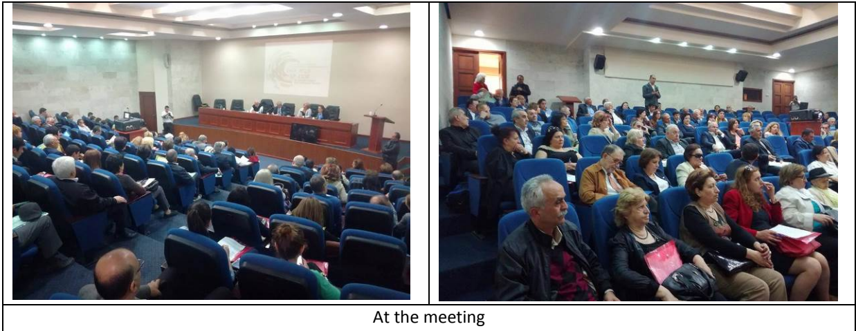
At the meeting