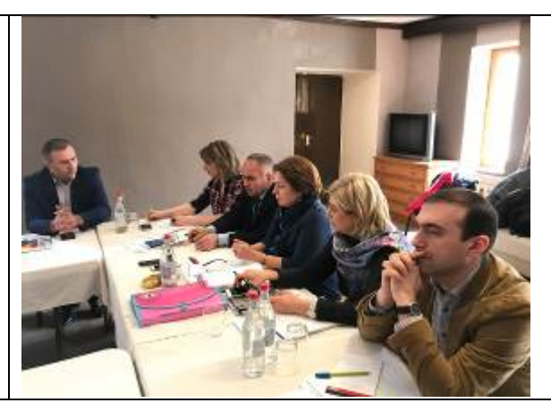
Two-day training workshop for members of the Intersectoral Monitoring Team