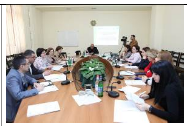
Participants of a working discussion