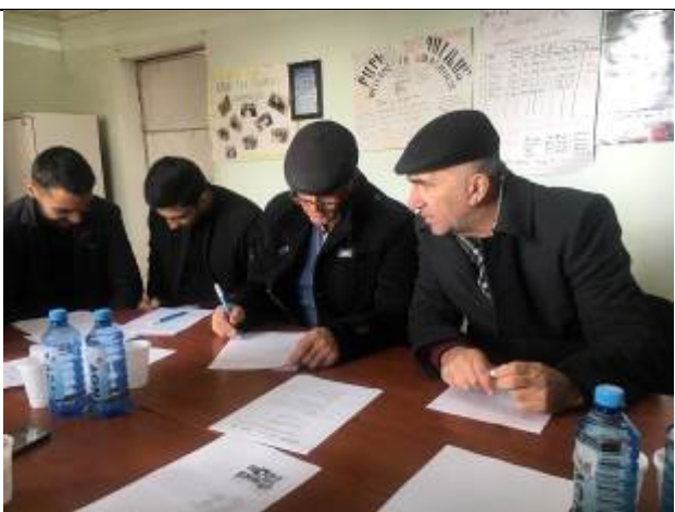
Participants of advocacy training