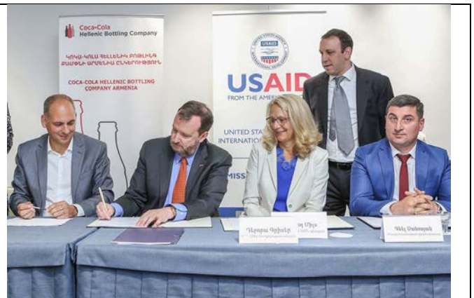
USAID and Coca-Cola HBC Armenia signed a Memorandum of Understanding