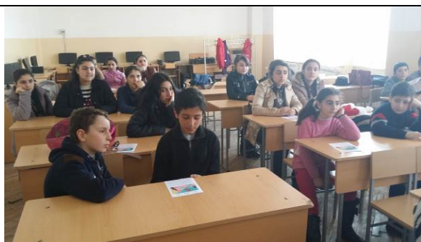
Lesson at the school in the Nor Kharberd village

The purpose of these trainings is to inform schoolchildren about the most important issues and problems related to water resources and wastewater. Instructors interactively discussed such issues as the importance of water for humans and nature, pollution and not efficient use of water resources, the hidden potential of waste water and its reuse. At the end of the trainings they showed a thematic cartoon and asked schoolchildren to draw thematic pictures for presentation at the conference on the 22nd of March.