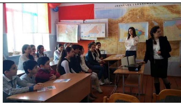
Lesson at the school 2, Spitak