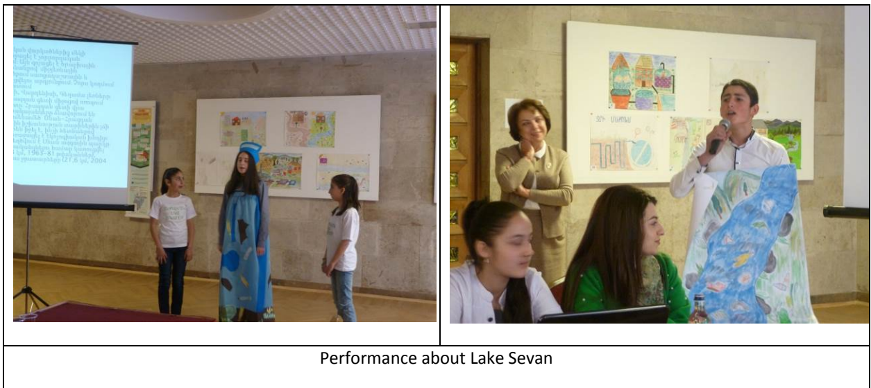
Performance about Lake Sevan

Pupils from the Gegharkunik village welcomed participants. They also presented the Ecoclub "Azhdahak". They showed the performance about Lake Sevan, its contaminated tributaries. Then they called on the participants to help the lake.