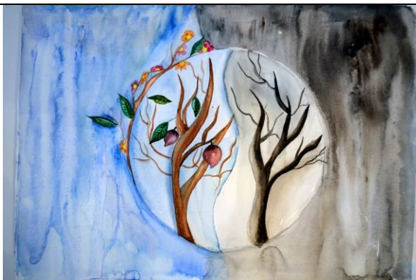
3d Prize "Water and wastewater"