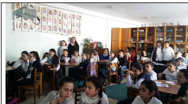
Lesson at the school 155, Yerevan

Prior to the conference, within celebrating the World Water Day, from the beginning of March, CWP-Armenia conducted trainings named "Let's save water: sewage as a water resource" for schoolchildren in 5 schools in Armenia (School 155 in Yerevan, School 2 in the Nor Kharberd village, School 2 in the Spitak city, and in the schools of the Gegharkunik and Margaovit villages).