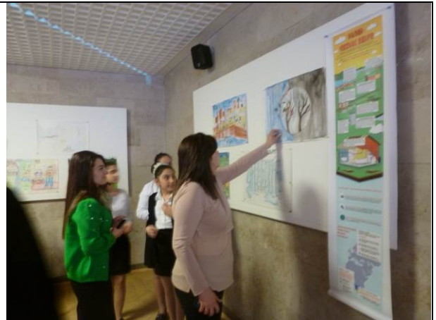
Conference participants select the best pictures