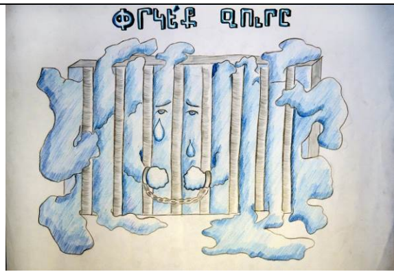
Honorable Prize "Save the Water"

The winners of the contest were awarded with books, and all contest participants and teachers awarded prizes and certificates.