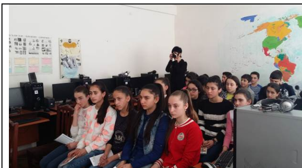
Lesson at the school in the Margaovit village