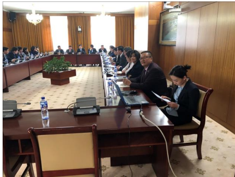
Government meeting on better water policy reform held on 22 March 2018