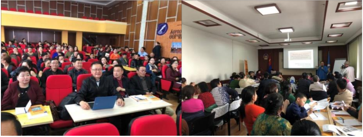
Lessons on the improvement of sanitation in Mongolia