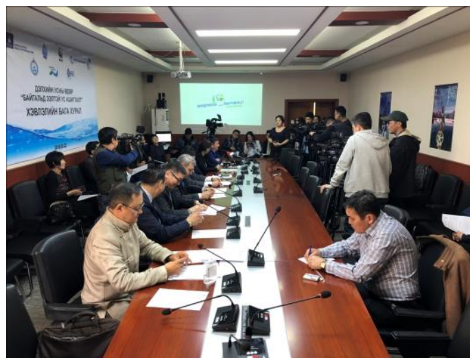
Press conference at the Ministry of Environment on 22 March