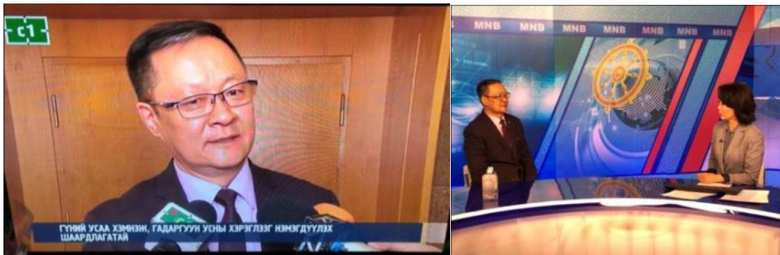
About wastewater reuse: on national TV of Mongolia and on TV C1

CWP-Mongolia provided a number of interviews to various TV channels and newspapers: