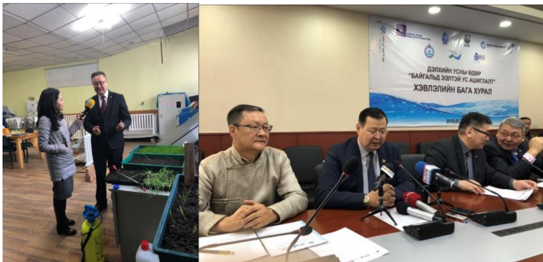
About SDG6 and waste as valuable source on ETV