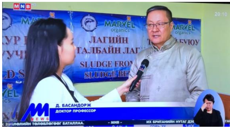
About wastewaters water source on National TV