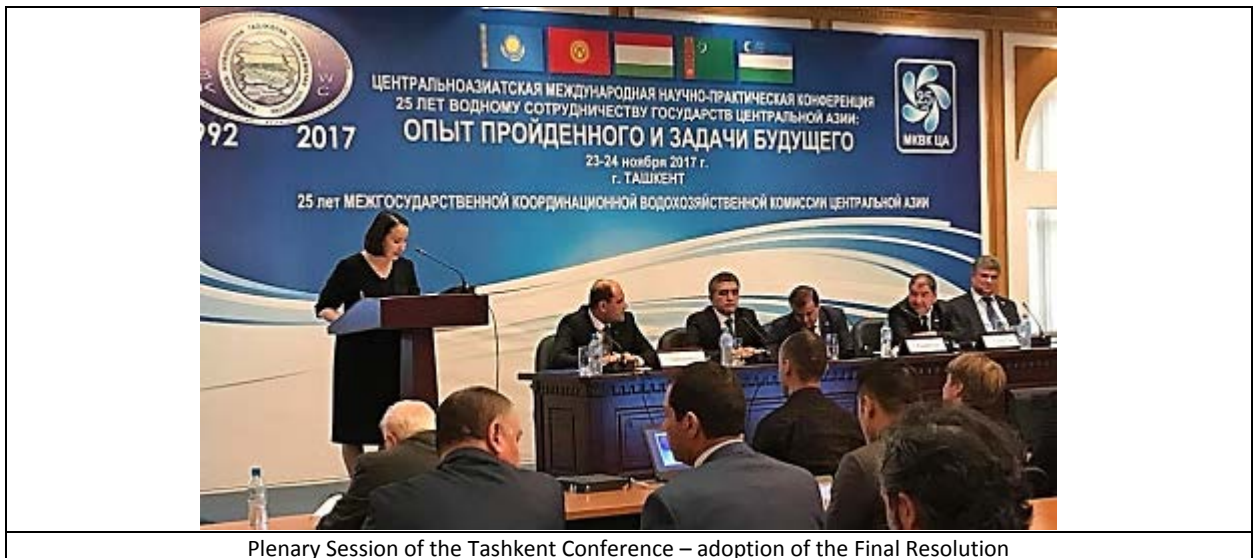
Plenary Session of the Tashkent Conference – adoption of the Final Resolution

Finally, the Conference adopted its resolution, see in: http://sic.icwc-aral.uz/releases/eng/322.htm