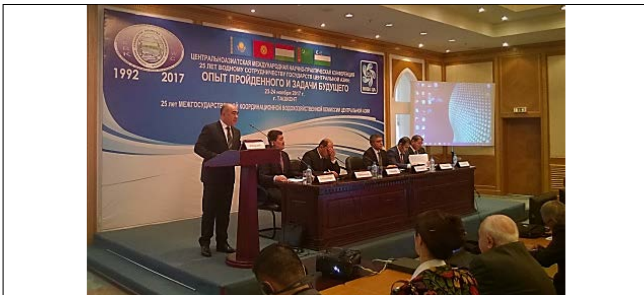
At the opening ceremony, Deputy Premier of the Republic of Uzbekistan and Minister of Agriculture and Water Resources Mr. Mirzaev welcomed the participants on behalf of the Government of Uzbekistan.

The Conference was attended by about 250 representatives of various national, regional, and international organizations from more than 15 countries, including representatives of embassies, UNDP, German Society for Cooperation (GIZ), ADB, WB, OSCE, UNESCO, International Commission on Irrigation and Drainage (ICID), Geneva Water Hub, International Network of Basin Organizations, Global Water Partnership for Central Asia and Caucasus, National Water Partnership (NWP) GEF Agency of the International Fund for saving the Aral Sea in Uzbekistan, Basin Water Organizations of Amu Darya and Syr Darya, Central Asian Regional Environmental Center.