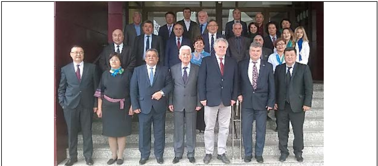
Group photo of the GWP CACENA meeting in Bishkek

Then participants discussed GWP Strategy to 2020 - what we need to change at the country and regional level on the agenda of the Water Partnership Network on the Road to Water Security. In this line also was discussed GWP CACENA regional work plan for 2018 (the core budget activities)