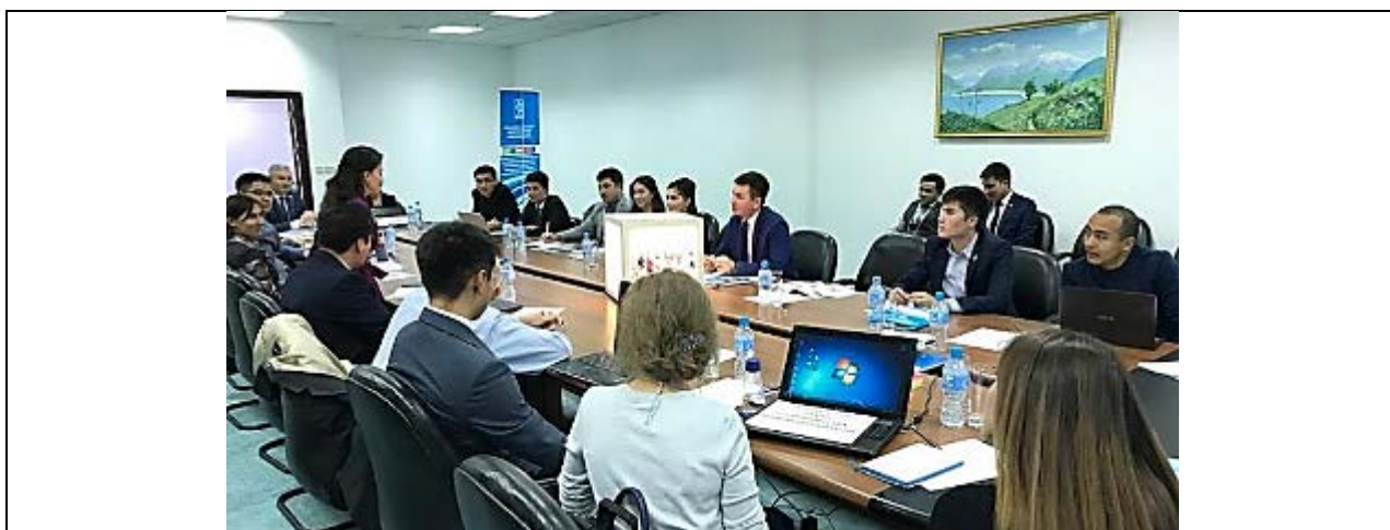
The special session was organized with participation of young water professionals to address the water use related issues.

The Conference was attended by about 250 representatives of various national, regional, and international organizations from more than 15 countries, including representatives of embassies, UNDP, German Society for Cooperation (GIZ), ADB, WB, OSCE, UNESCO, International Commission on Irrigation and Drainage (ICID), Geneva Water Hub, International Network of Basin Organizations, Global Water Partnership for Central Asia and Caucasus, National Water Partnership (NWP) GEF Agency of the International Fund for saving the Aral Sea in Uzbekistan, Basin Water Organizations of Amu Darya and Syr Darya, Central Asian Regional Environmental Center.