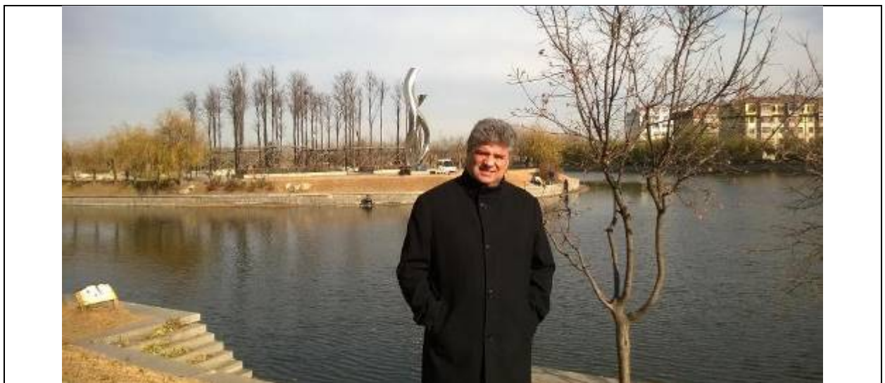
On Day 3, participants joined a field visit to sites of the ADB Qingdao Water Resources and Wetland Protection Project and heard presentations by the project team

The workshop has been proceeded during three days. During Day 1 and 2, expert resource speakers presented and facilitate discussions on topics including river basin management approaches, water conservation techniques, and eco-compensation programs. Country delegations presented their experiences with river basin management.