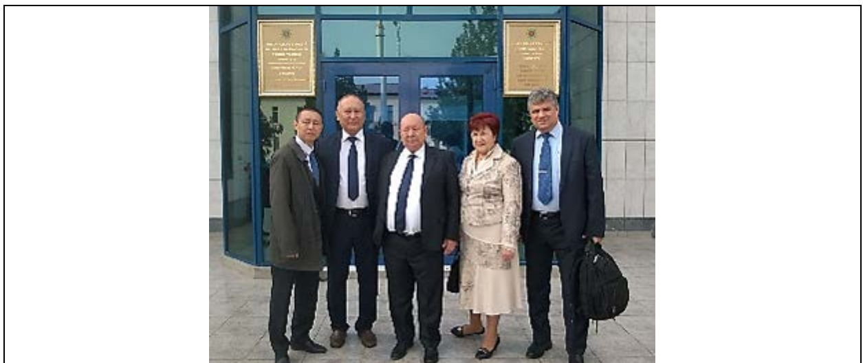
In front of the new office of the EC IFAS in Ashgabat (with partners from CWP Kazakhstan)

In particular, coordination of measures to support and update the Regional Environmental Action Plan (REAP) was discussed. The document has been approved by the IFAS Board in 2003 in five priority areas: water pollution, waste management, degradation of mountain ecosystems, land degradation, air pollution. In connection with the adoption by the Central Asian countries of the Sustainable Development Goals and the Paris Agreement, it has become necessary to revise this document in the light of global and regional agenda.