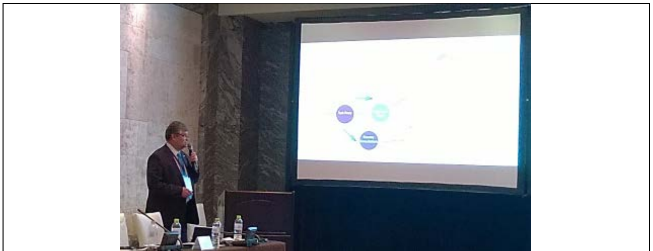
The GWP CACENA Regional Coordinator Vadim Sokolov presented the GWP's experiences and programs.

The main goal of workshop was to learn from its good practices on IWRM and to share their own experiences. The workshop focused on techniques for basin-level IWRM to combat water scarcity. This included content on practical river basin management approaches, such as defining water rights and trading systems among competing users. It also included content on eco-compensation programs and on restoring rivers through basin-level management and investment planning.