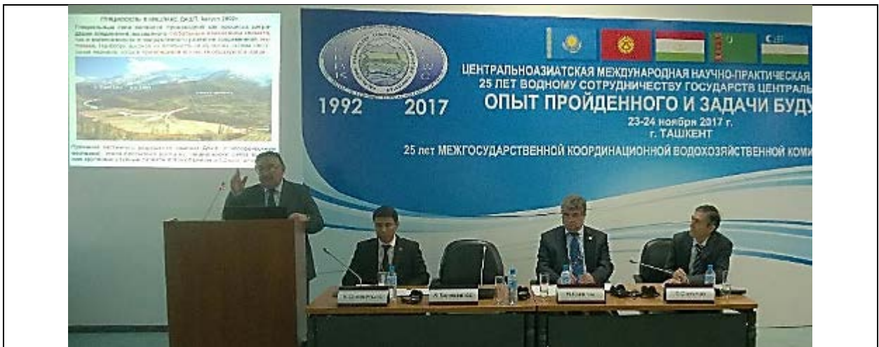
The round table 6 “Water Resources and Ecosystems” was co-chaired by GWP CACENA and Eco Movement of Uzbekistan

The exhibition showcased best practices and scientific achievements in the area of water conservation and sound water use, automation of waterworks facilities, metrology and up-to-date water accounting facilities.