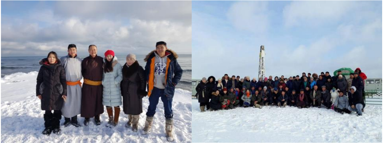
Ubs lake basin - the World Heritage part