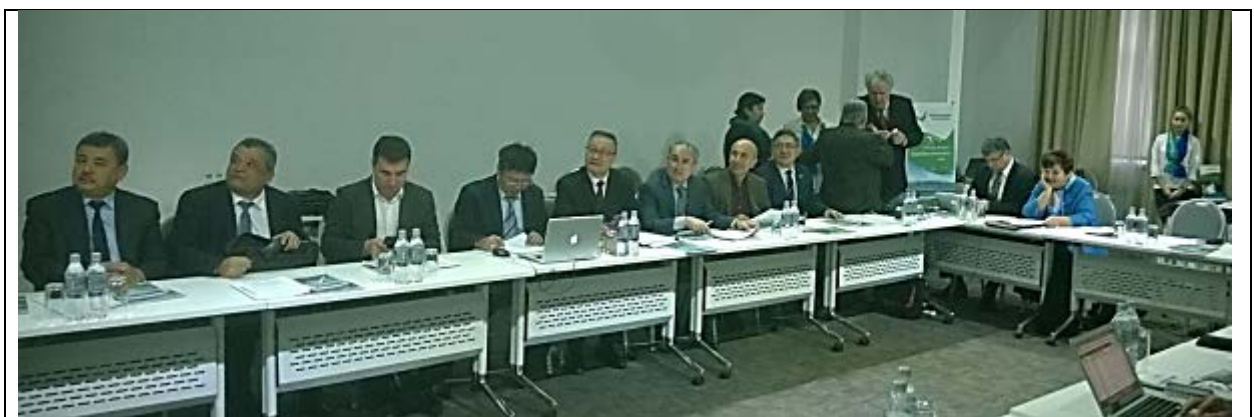
Working moment of the meeting in Bishkek

The special session was addressed to results of the Gap assessment in the implementation of the Paris Agreement on Climate Change (executed by external expert Andriy Demydenko from Ukraine), and discussion of the WACDEP project work plan and budget for 2018-2019