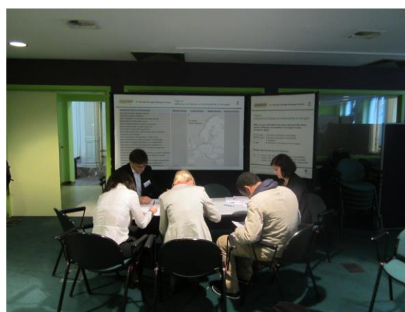
Second Pan-European Union Drought Dialogue Forum.