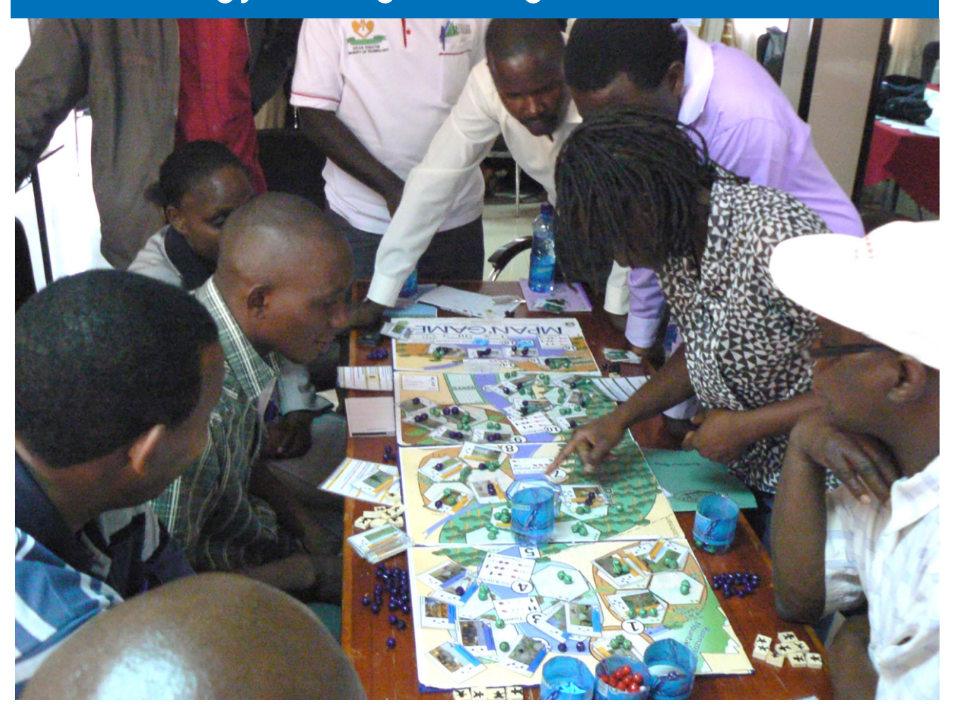
Community members playing Mpan'game

ne of GWPEA partners named "Mpan'game Club" is a nonprofit-making organization registered in Uganda that was named after Mpan'game, a community participatory board game designed along River Mpanga and aimed at