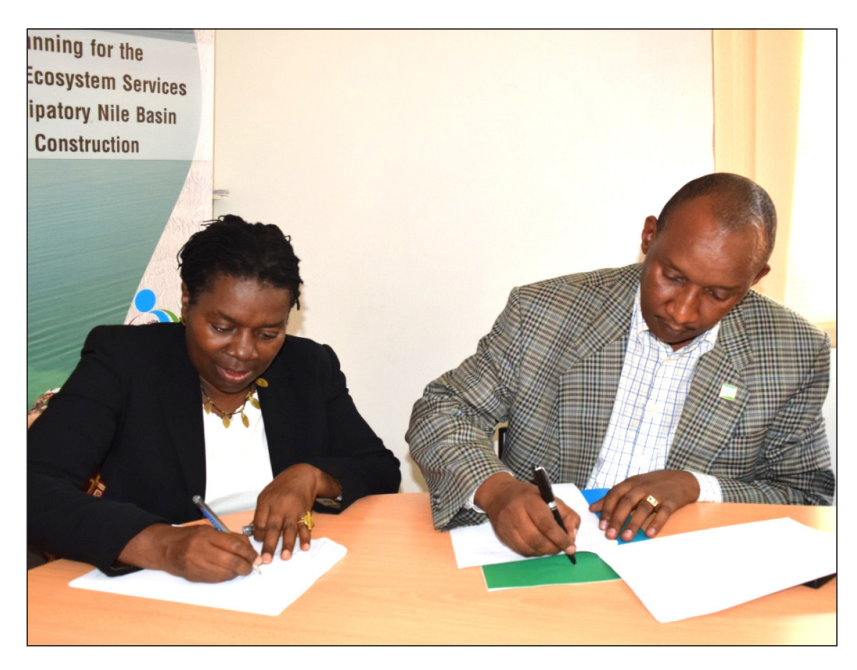
Signing an MoU between GWPEA and NBD

n March 4<sup>th</sup> 2016, GWP Eastern Africa and the Nile Basin Discourse (NBD) signed in Entebbe, Uganda, a Memorandum of Understanding for collaboration and partnership.