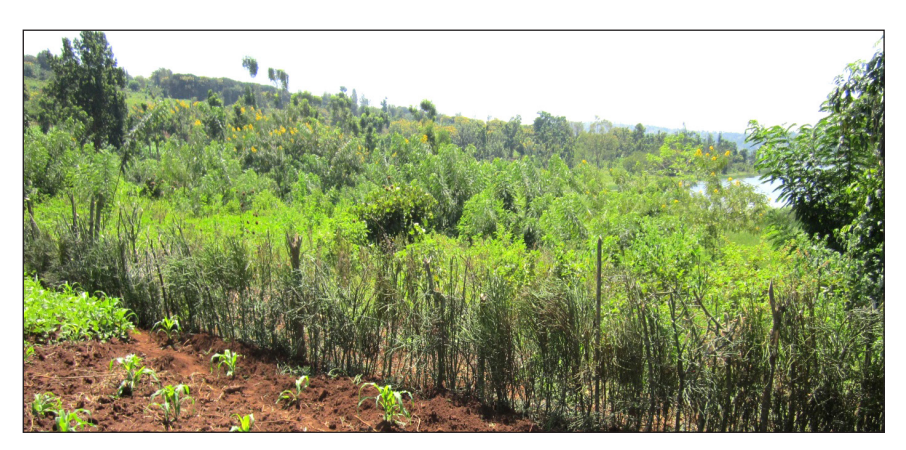
Demarcation line made with euphorbia tirucalli trees

The meeting examined the status of WACDEP implementation and noted that it nears its end and the District/Sector/local communities are prepared to take over and maintain the activities. It also noted that MINIRENA as line Ministry has been involved in the implementation process, especially in the capacity building component. On this note, the meeting