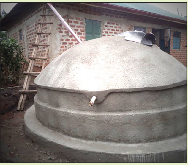
Completed underground water tank

Members have been guided on the type of trees to plant for the apiary unit and also supported with 60 bee hives. A total of 1000 caliandra seedlings were purchased and distributed for both planting at the demonstration unit and also farmer land holdings