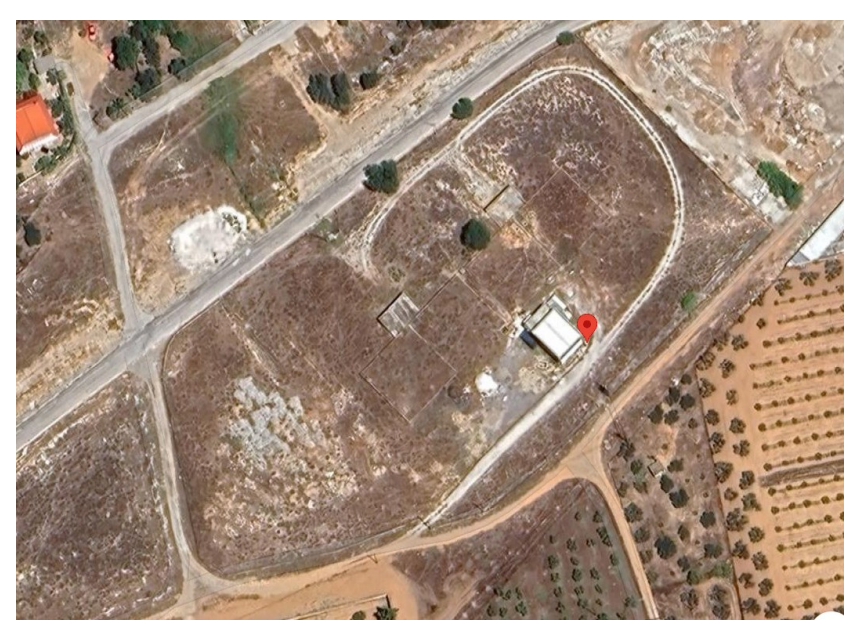
Figure 2. The Water Treatment Plant of Corinth