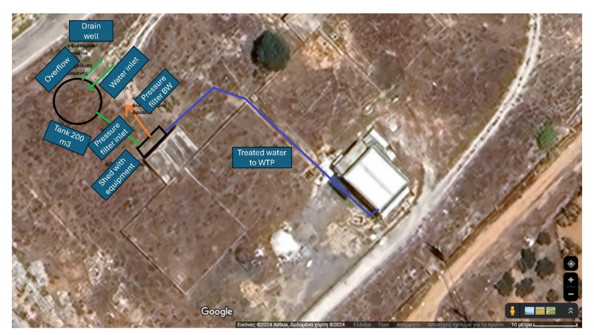
Figure 3. An indicative allocation of the equipment in the WTP area.