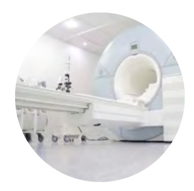
HEALTH improved health services for 12 million individuals