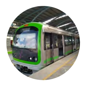
TRANSPORT 631 million additional annual trips made on EIB financed public transport