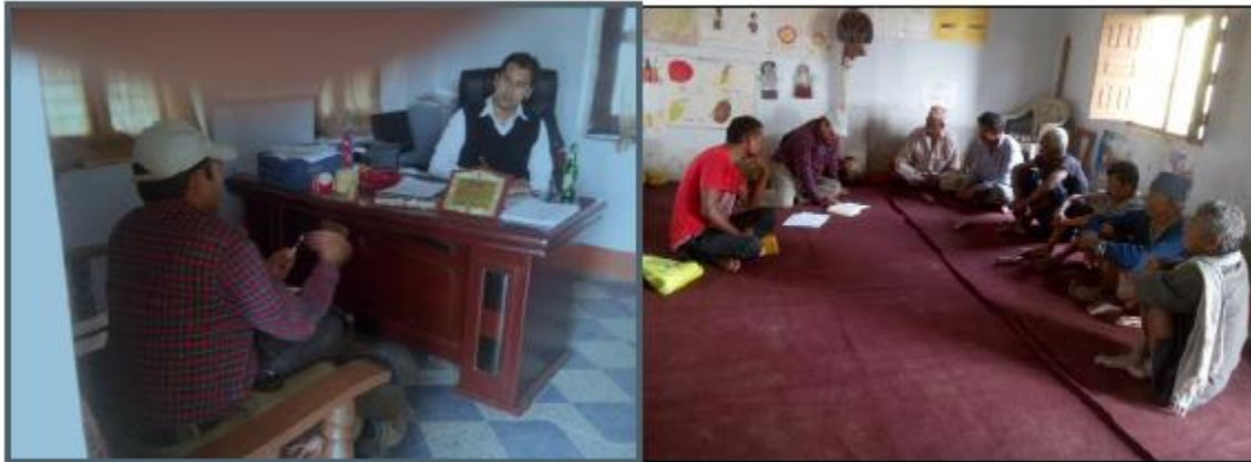
Discussion with the Executive Director of Rajapur municipality Consultation with local indigenous Tharu community