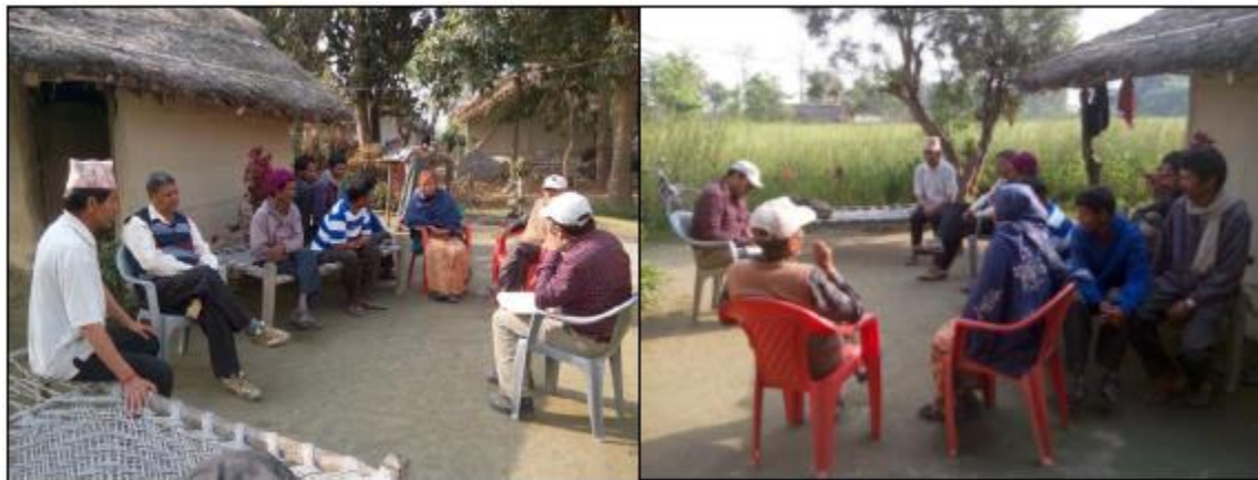
Consultation with local people at Shankarapur (Bardiya)