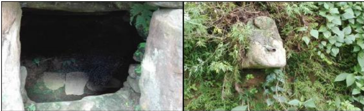
Dried well in Dapcha-Kashikhanda Municipality Dried tap in the study area

Other information—web links to reports, news items, etc.: jvs-nwp.org.np/publications