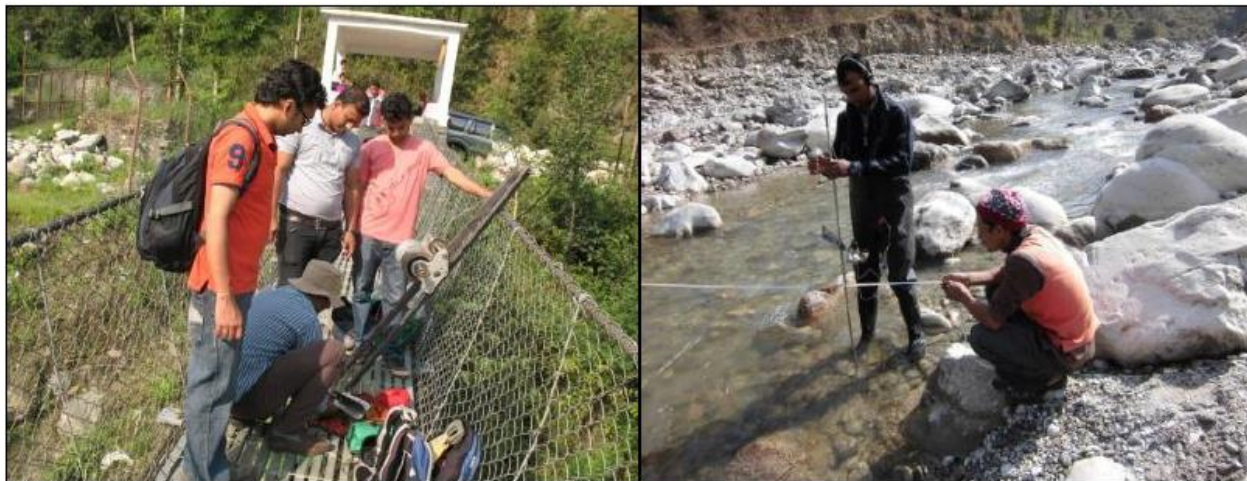
Pre- and Post-Monsoon Surveys

Web link: https://jvs-nwp.org.np/sites/default/files/Final%20Report_E-flow.pdf