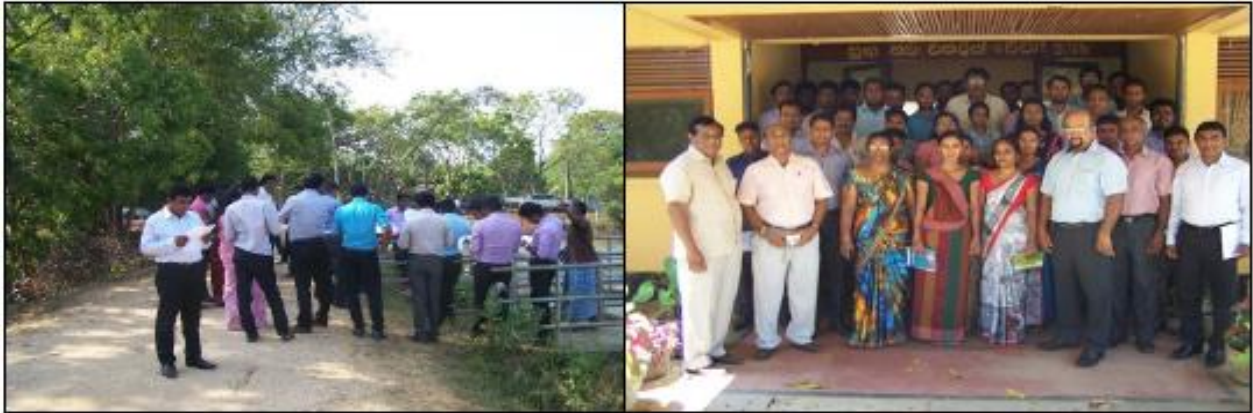
Field visit – On demand Irrigation Participants at the session