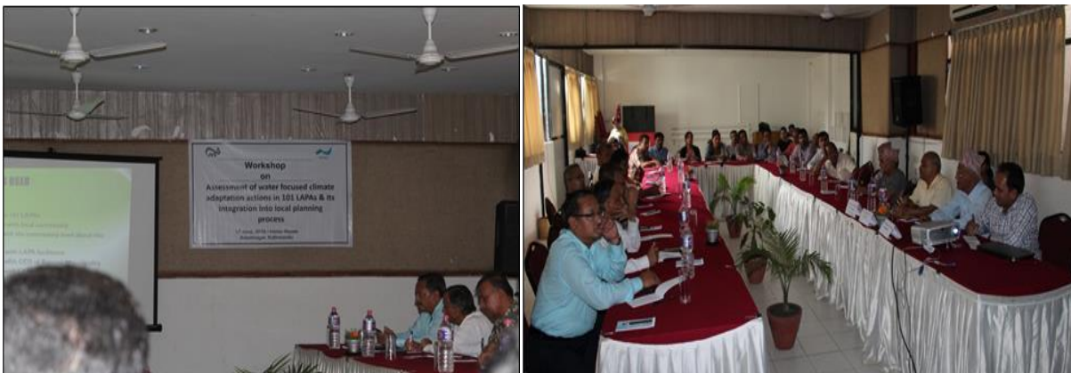
Workshop on 'Assessment of Water Focused Climate Adaptation' Participants of the workshop