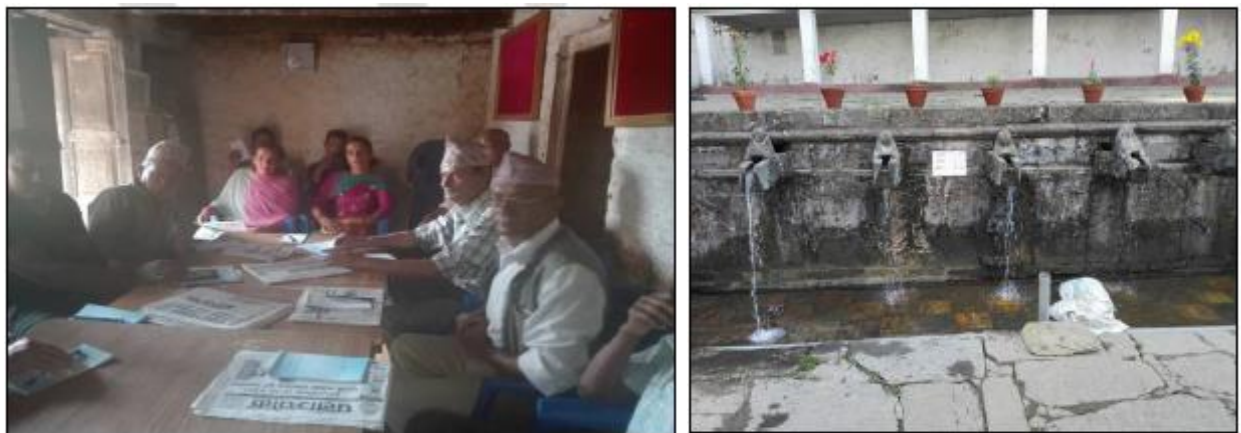
Participants of Focus Group Discussion Decreased water flow from stone spouts at Matatirtha, Chandragiri Municipality, Kathmandu