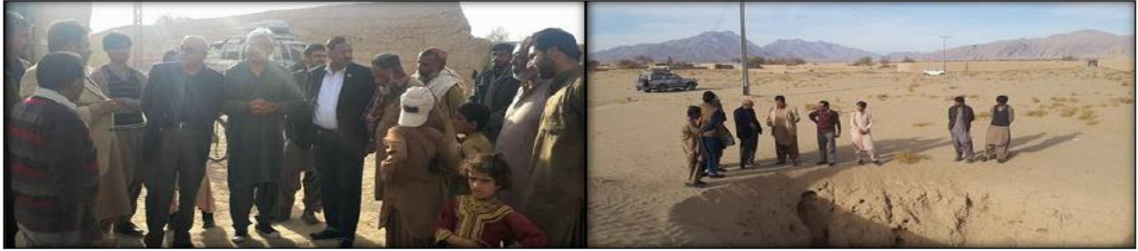
Field visits by PWP