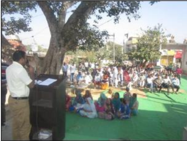
Image 1: Discussion on Detailed Investment Plan with village community on 27 November 2016