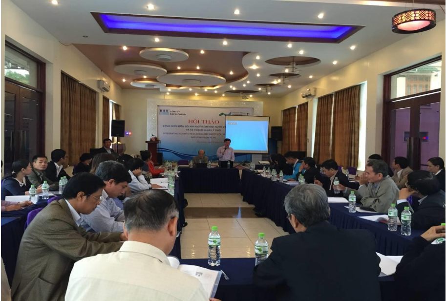
Workshop introducing Measures to integrate climate change and water security in managing operation system in Bac Hung Hai Irrigation system on 25 th November 2015