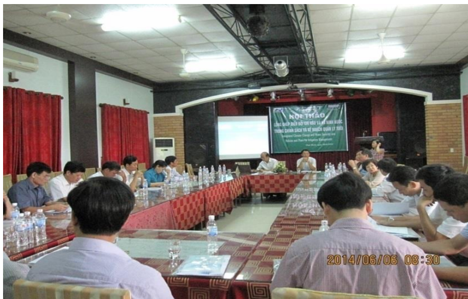
Workshop in Thai Binh Province (6/2014) on Measures to integrate climate change and water security into irrigation management