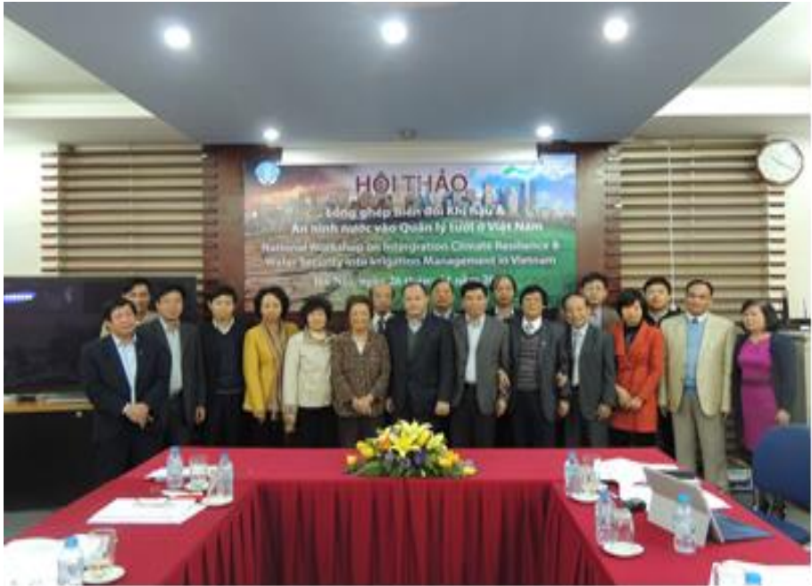
National workshop on Integration Climate Resilience and Water security into Irrigation Management in Vietnam on 26 November 2016 in Hanoi, Vietnam.