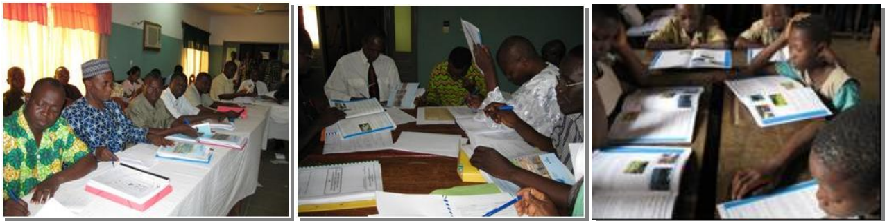
Pictures 8 - 10: Teachers participating in a training session and a manual explanation session

and teachers, as well as resource persons), and promoted amongst senior officials of the Ministry of Primary and Nursery Education. An updated version was published in 2008, including a foreword by the Minister. A partnership agreement was signed between the Minister in charge of primary education and CWP-Benin in order to ensure proper integration of the concepts developed in the manual into school curricula (Pictures 8-10).