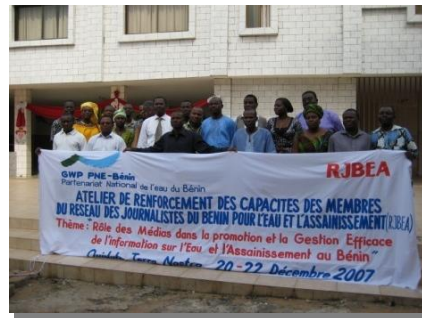
Picture 14: Participants in the Ouidah training session in December 2007

CWP-Benin relied on that network to carry out various media campaigns, mainly for the adoption of the national water policy by the Government in 2009, the transmission by the Government to Parliament the request regarding the ratification of the 1997 United Nations Convention on Non-navigable Uses of International Watercourses, and the on-going advocacy for adoption by Parliament of a new water law.