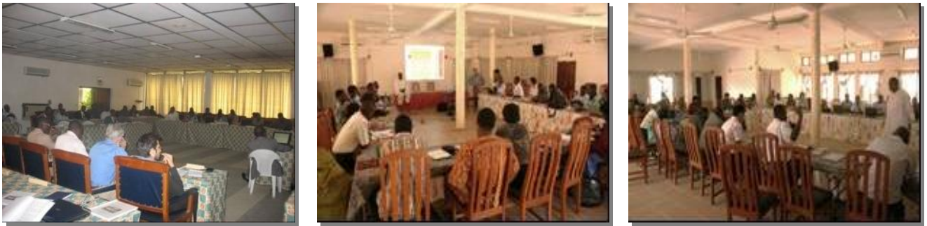
Picture 5 to 7: Participants in the workshops on validation of water situation analysis report (January 2007) and application of WRIAM method (September 2009)