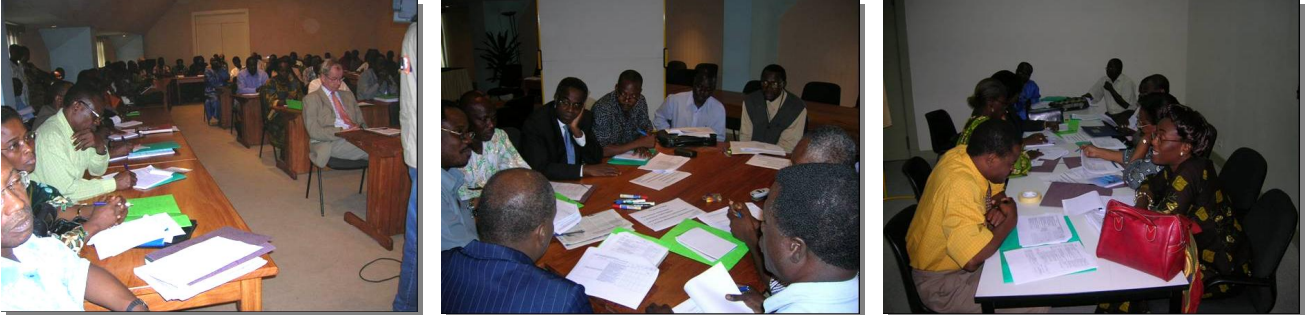
Picture 2, 3 and 4: Participants to the plenary and working group sessions during a PAWDII workshop