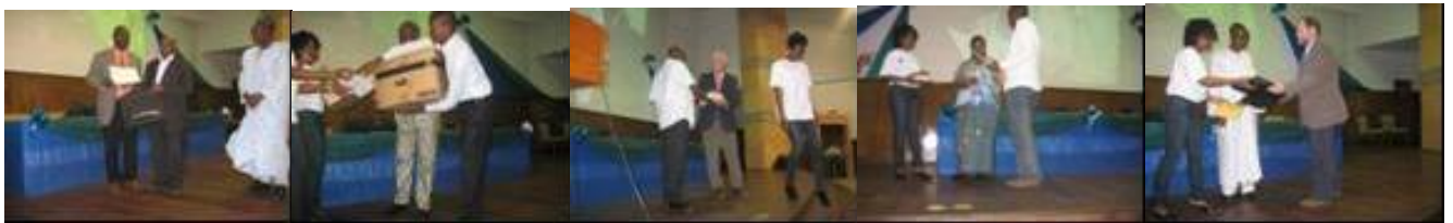
Pictures 15 - 19: Awards ceremony for the winners of the media competition on water, sanitation and IWRM

In addition, the first media competition on water and sanitation, organized by CWP-Benin with connection of RJBEA, also contributed to building Beninese