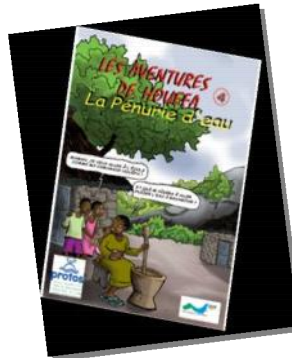
Pictures 11 and 12: School Manual “Water, Hygiene, Health” and Cartoon Issue 4 in the series “Houéfa’s Adventures”