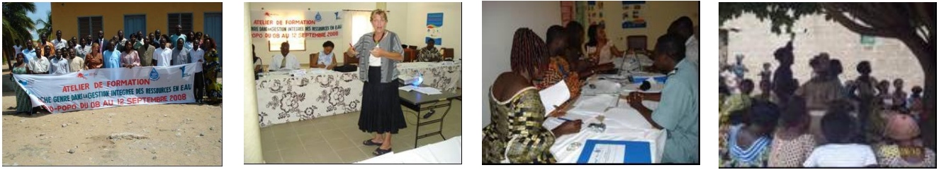
Pictures 20 - 23 : Participants in gender training (plenary, break-up sessions and field visit)

The training session allowed participants to provide inputs to on-going reflections in Benin, in order to facilitate integration of gender approach in the activities identified in the national IWRM action plan and implementation of national development orientations. At the end of the training session, each participant had developed an action plan for gender and IWRM promotion in his/her organisation or field/sector of intervention.