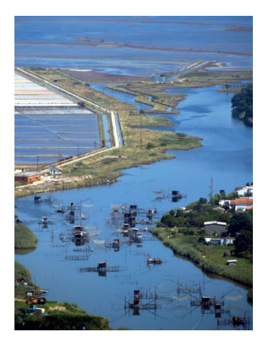
Fig. 4: Unsustainable fishing methods, (GWP-Med et al., 2015)

strategy in Montenegro has led to landscape and nature degradation of the area. In addition, basic infrastructure and municipal services are poor in both borders of the river and are unable to meet the needs of the rapid spatial transformation. Road networks are outdated and not well maintained, resulting in severe traffic jams especially in the summer months. Drainage channels are also blocked and badly maintained causing frequent flooding in both the Albanian and Montenegrin watersheds. The potable water sources and wastewater treatment plants are too few to meet the demand of the increasing population. Moreover, waste management systems are inadequate and unsustainable. In the Montenegrin area, solid waste is collected in sanitary landfills, whereas in the Albanian part, waste is dumped illegally into ditches, with a huge environmental cost for the river banks, groundwater and seawater quality. As a consequence, the inland environment and the water bodies of the area are highly polluted with consequent risks to human health (GWP-Med et al., 2015).