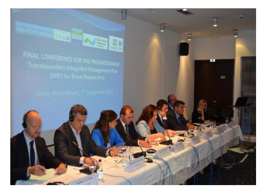
Figure 5: Final Consultation Meeting, Ulcinj, September, 2015

supports and enables planners and interested parties to make efficient use of the limited resources in coastal zones. The Plan was completed over a 5-year time frame, with cooperation between Partner Organizations: the Regional Activity Centre for the Priority Actions Programme (PAP/RAC), Global Water Partnership Mediterranean (GWP-Med), UNESCO-International Hydrological Programme (UNESCO-IHP) and two teams of National (Albanian and Montenegrin) experts. The aim of the Plan as defined by the partners was "to support the efforts of the governments of Albania and Montenegro to improve the integrated management of the natural and anthropogenic environments in the Buna / Bojana area"