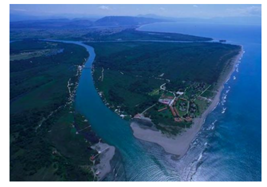
Figure 2: Coastal marine waters in Buna / Bojana river mouth (GWP-Med et al., 2015)

The complexity of the landscape components of the Buna / Bojana watershed, as well as its transboundary nature, make it an interesting case for study and analysis. Natural linkages between lakes and rivers, brackish waters and groundwater, inland and coastal zones in the area as well as the ongoing development of the socio-economic