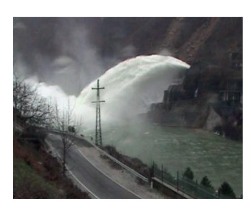
Figure 3: Outflow of the Vau-I-Dejes dam, January 2010, (GWP-Med et al., 2015)

According to the World Bank, the Southeast Region of Europe will be severely impacted by global warming. Climate change variability, mainly reflected by temperature increase, extreme weather events such as droughts and flash floods, low precipitation, and sea level rise, highly impact the situation of the area, putting its households and agricultural land in danger. Sea level rise and storms